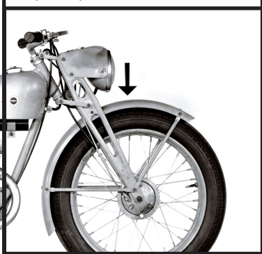
Step 7: Optic Sensor Placement.

Note: fluorescent or LED lighting will not activate the module; to test use an incandescent light source or move outdoors.